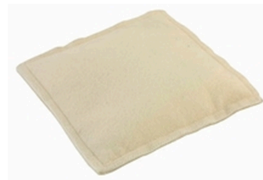
Book Support Bags and Cushion Cover