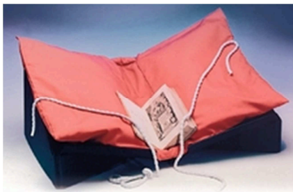
The Conservation Bookmate

This mailing will highlight the need for book supports in libraries, archives, museums, conservation areas and other heritage facilities. It will also highlight 3 different book support systems that are available in the ETHER Conservation range.