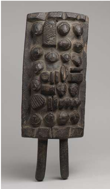
Memory Board (Lukasa), 19th–20th century Democratic Republic of Congo; Luba