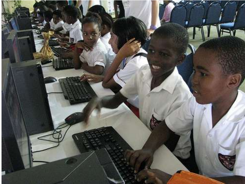
Ulwazi project, KwaZulu-Natal, South Africa