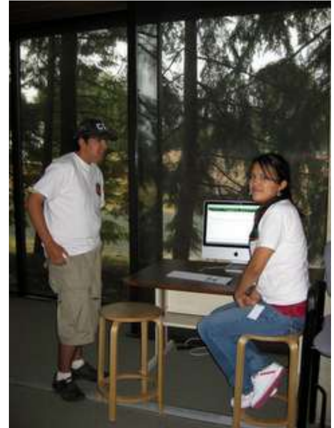
Reciprocal Research Network, University of British Columbia and Museum of Anthropology, Canada